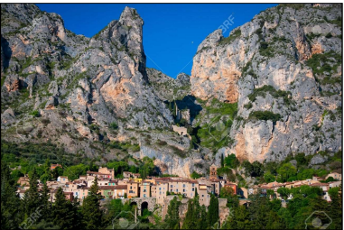
Moustiers Ste Marie