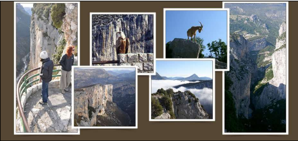
Route des Crêtes